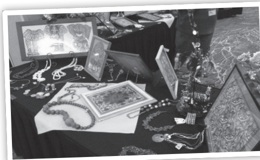
Fun items in the banquet boutique store.