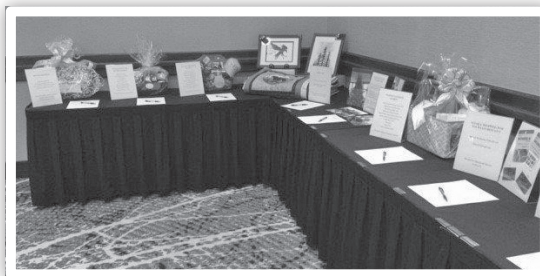
Generous silent auction donations.